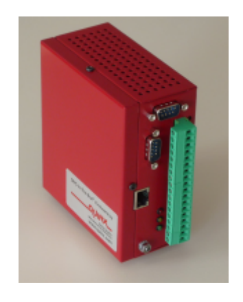
SCD-II (Smart Communication Device)

The DNC4000 v5 recognizes any change in a NC program. The integrated WinMerge editor compares the two versions and highlights the changes.